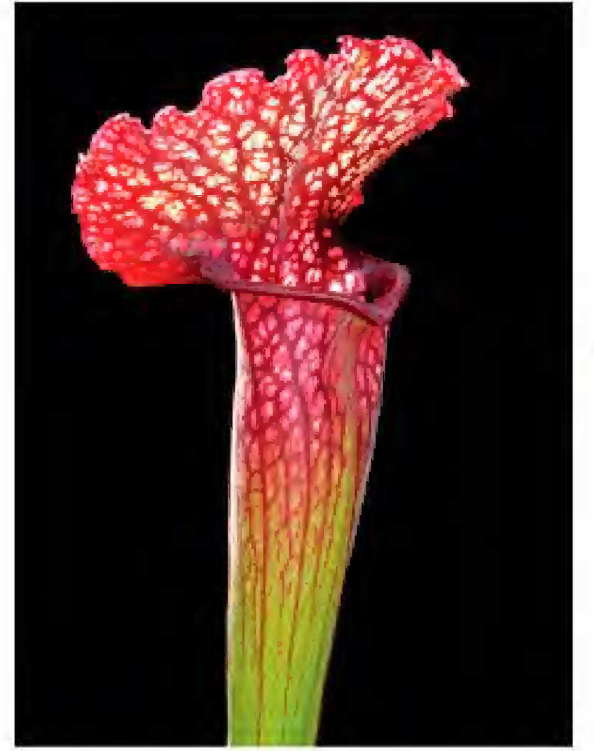
Figure 7: Sarracenia 'Premysl Otakar I' pitcher.

The cultivar's pitchers are 50–60 cm tall and 4–5 cm wide in their upper part (see Front Cover and Figure 7). The lid is about two times broader than the tube, with a maximum observed width of 10 cm. The lid is upright, flat, and semicircular in shape. The margin of the lid is finely undulated, similar to S. leucophylla . The most outstanding quality of 'Přemysl Otakar I' is its intense and contrasting colouration. The upper part of the pitcher is red-violet with remarkably strong veining that is an extremely deep maroon similar to the colour of black cherries. The white fenestrations contrast gorgeously with the maroon venation. The flower is similar to that of S. leucophylla in shape and colour (see Figure 8).